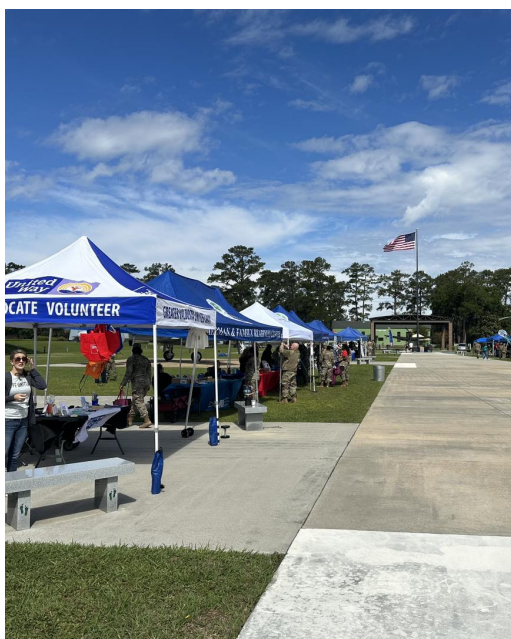
On March 4, GVUW attended the 3rd Annual Combined Awareness Day at Moody Air Force Base! It was an